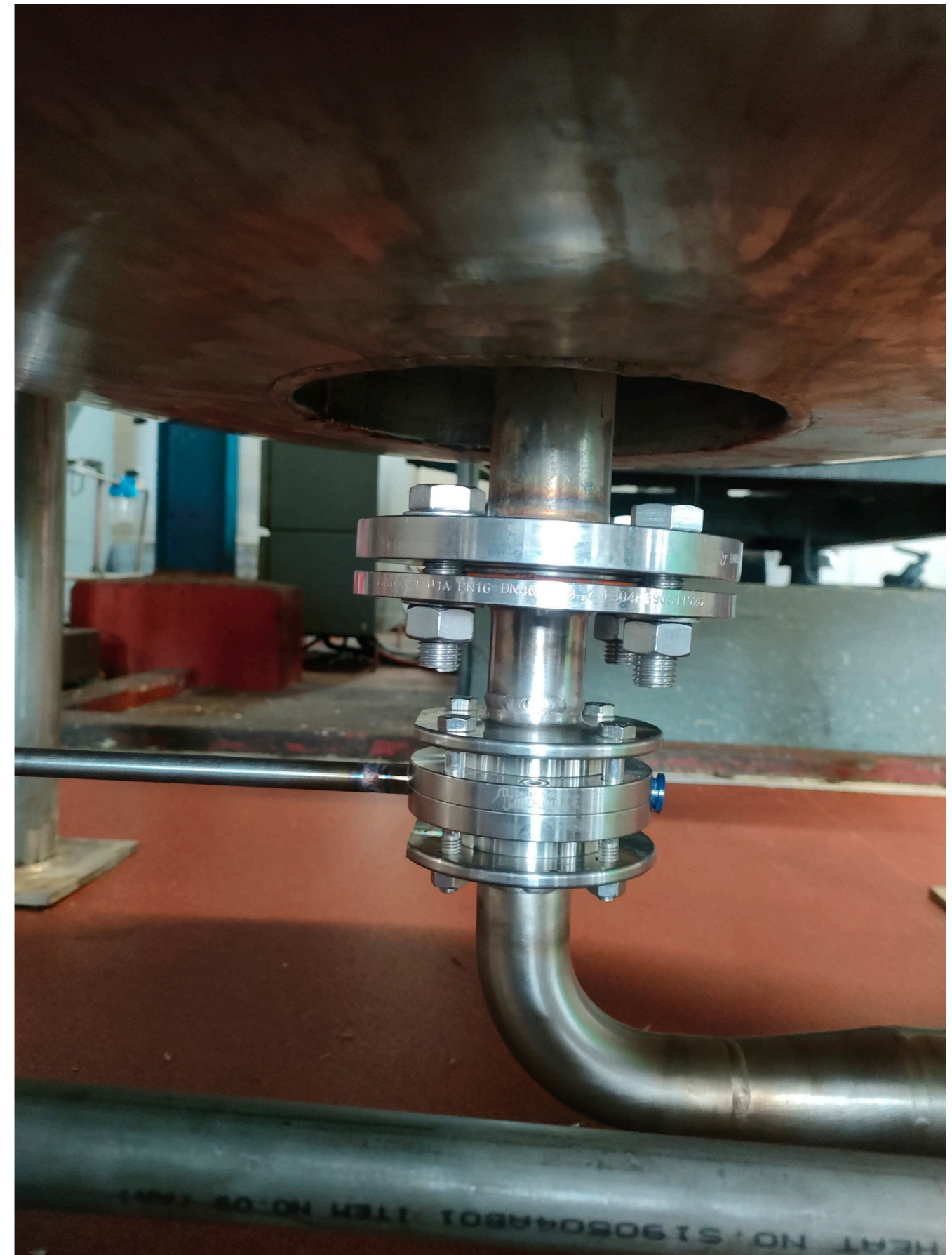
Figure 5: New connections and joints to allow steam and food product to travel without obstruction