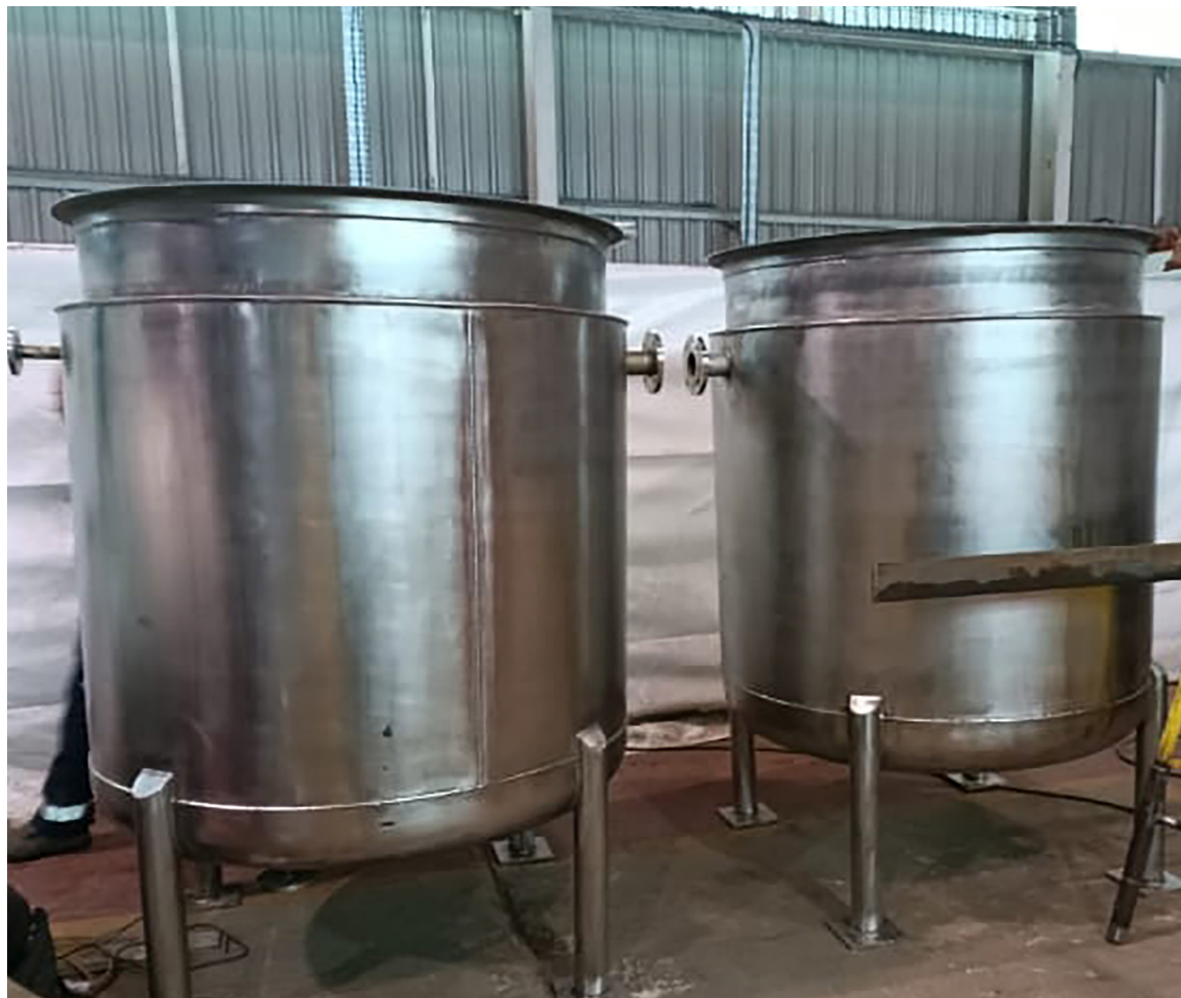
Figure 4: New tanks and associated lids pre connections and pipework

Whilst potentially a disruptive, dirty and complex job, the team worked systematically and co-operatively to deliver this scope to exacting standards. Their solution focused strategy enabled the client to effectively sustain operations, without disruption, and the close teamwork approach served to not only strengthen relationships across the team, but also with our valued client Cardowan Creameries.