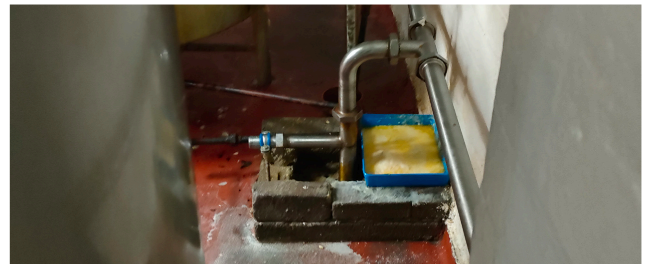
Figure 3: New pipes exiting tanks connected to product flow