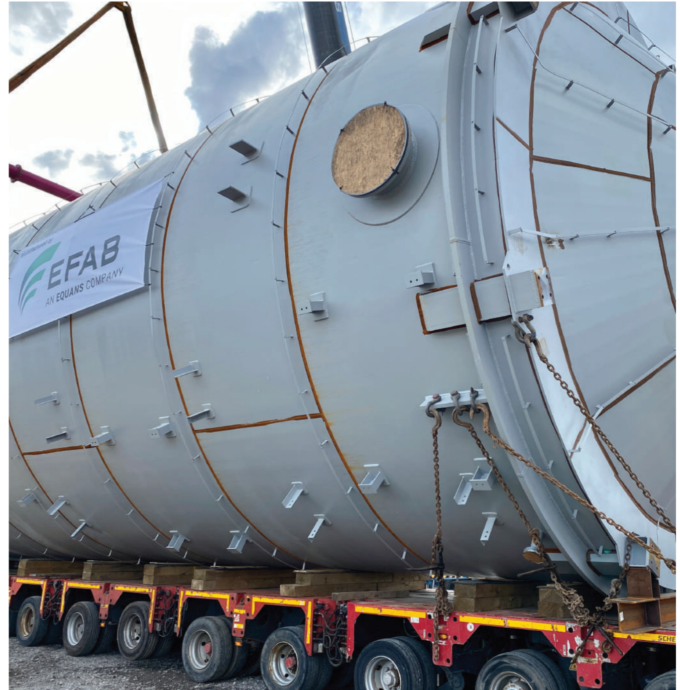
Figure 6: Securing tank to 12 axle trailer