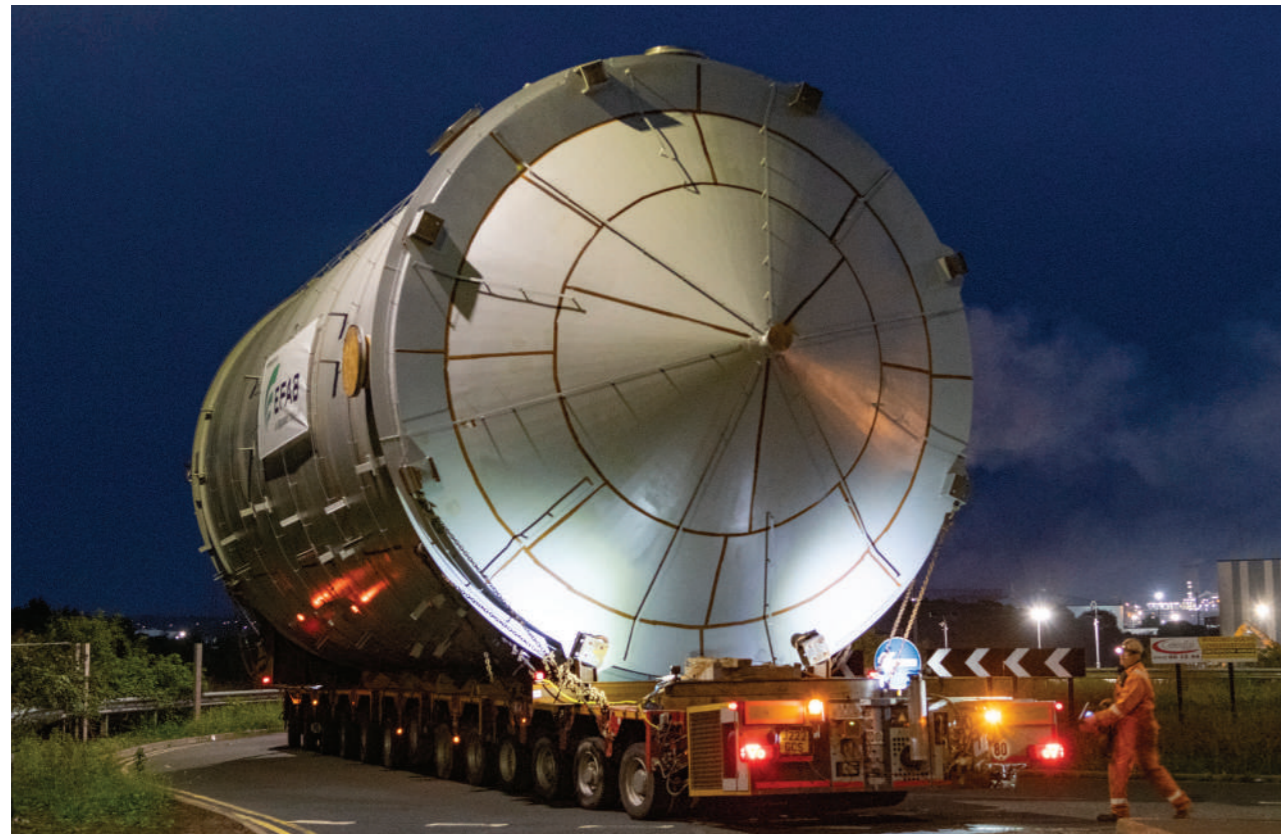
Figure 7: Road move on 12 axle trailer

Whilst the physical transportation scope took place within relatively short timescales, the need to liaise with so many parties, combined with tidal variations resulted in a project that could have very easily resulted in delays. Despite these challenges, the old tank was removed, and the new tank installed safely and successfully.