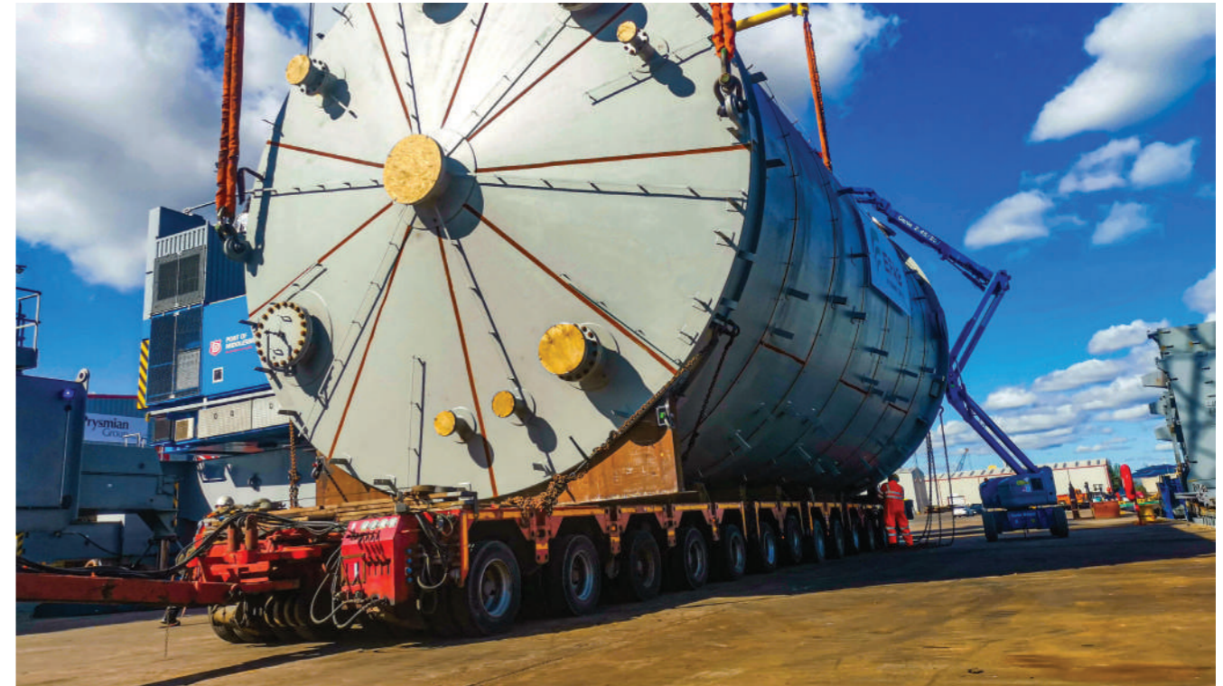
Figure 3: Tandem crane lift at AV Dawsons