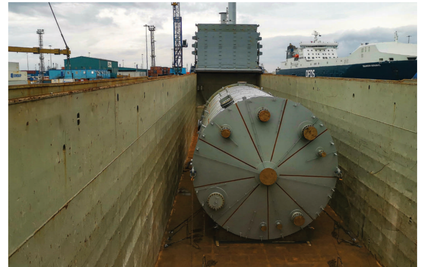
Figure 1: Tank secured in coaster vessel using chains

Malin Abram were brought on board to manage the transportation of the new tank from EFAB's facility in Immingham to the Ensus site, as well as the safe and efficient removal of the existing tank. This represented a relatively complex scope, with lots of moving parts owing to the need to transport by land and sea, and the number of parties involved. Indeed, this multi-faceted project required expert co-ordination from a project management perspective ensuring that all key services were aligned, including mobile craneage, port craneage, road haulage, coaster vessel chartering, Police, Network Rail, and removal of street furniture to make it all possible. The project also represented the first with a new client, EFAB, and whilst the project had its challenges, the old tank was removed, and the new tank installed safely and successfully.