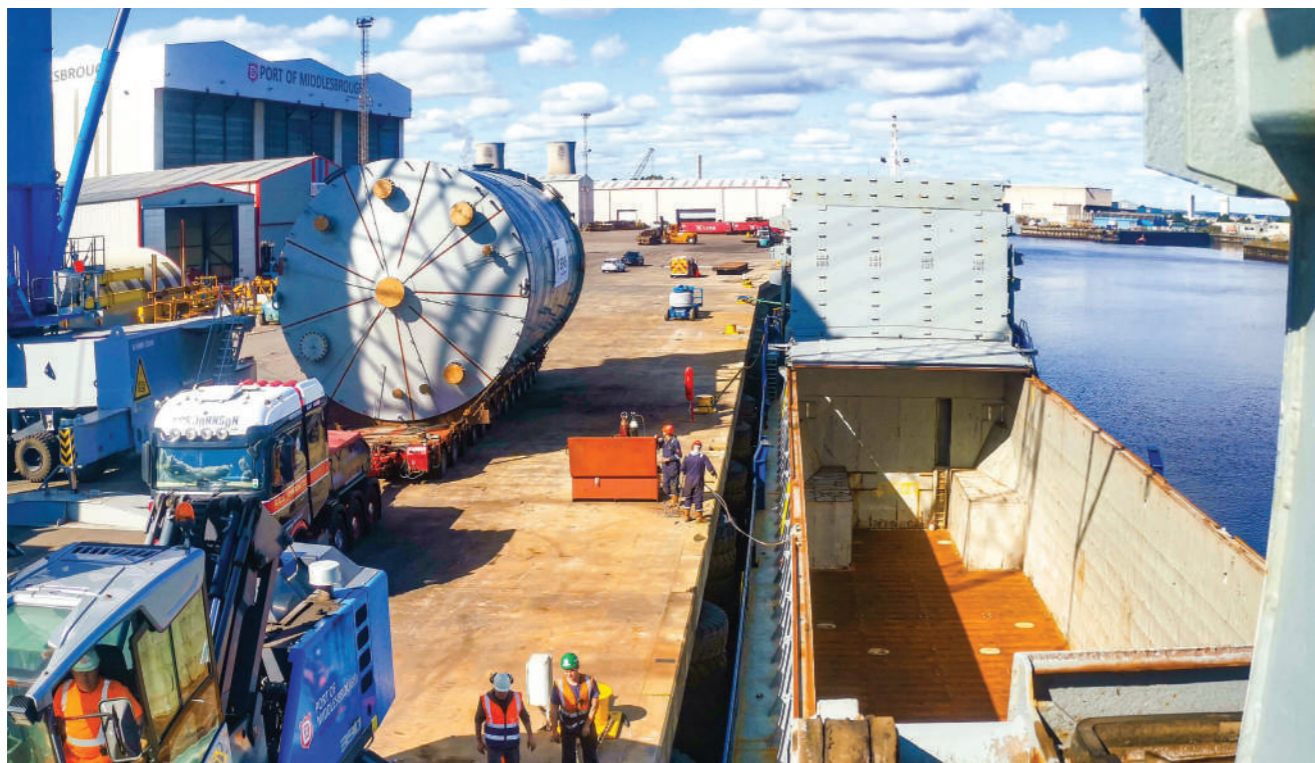
Figure 2: Discharging at AV Dawsons

As noted above, our client was looking for a turnkey solution, which meant that all road moves, (including liaising with Police and Council Authorities), the loadout to coaster vessel, securing and seafastening, unsecuring and removal, discharge to road transport, road move to Ensus and the installation of the new tank were all part of our overall scope of work. As such, project planning was critical, ensuring all required stakeholders were aligned, avoiding unnecessary delays and a safe delivery of the new tank to the Ensus site.