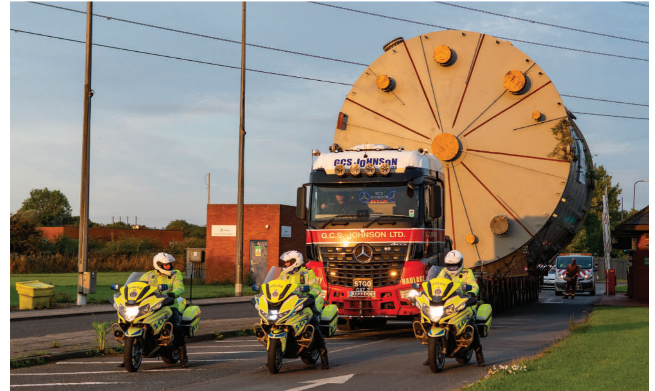
Figure 8: Police escort from AV Dawsons to Ensus