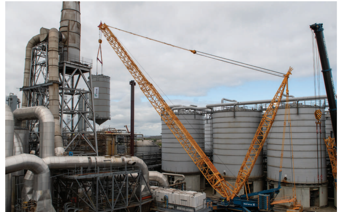
Figure 9: Lifting tank into final position